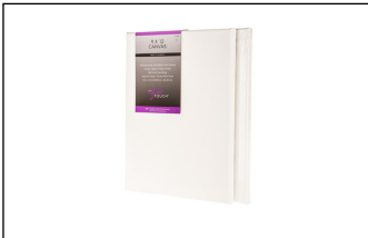
Canvas - $3.00

Purchase the art materials listed below. They are available at Hobby Lobby or online at Dick Blick.